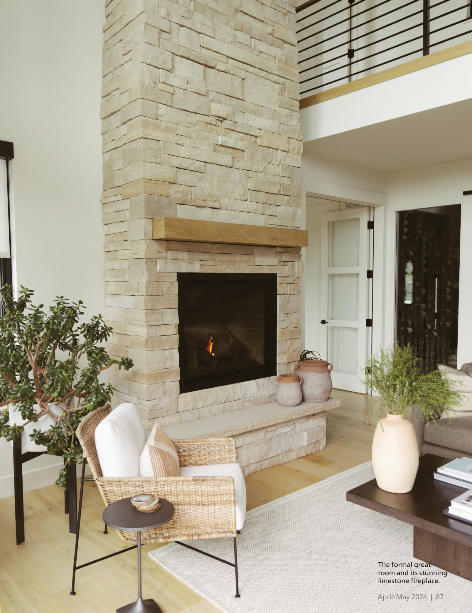
The formal great room and its stunning limestone fireplace.