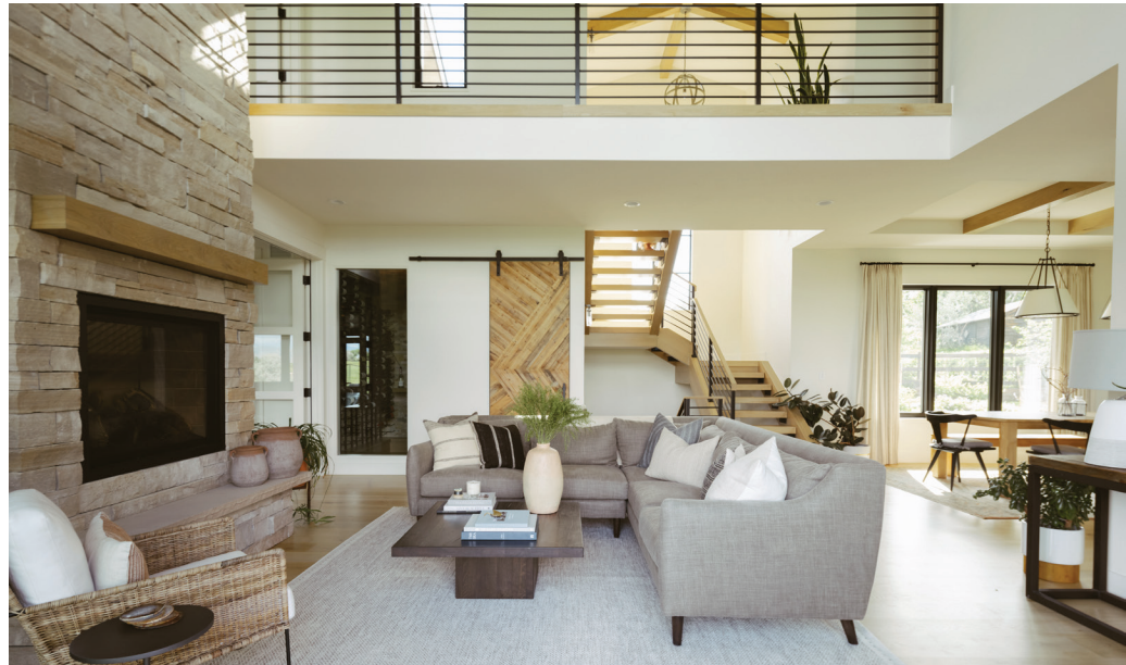
The wine room, concealed by a barn door, was awarded a LUXE Red Award in 2021 for Best Jewel Box Room.