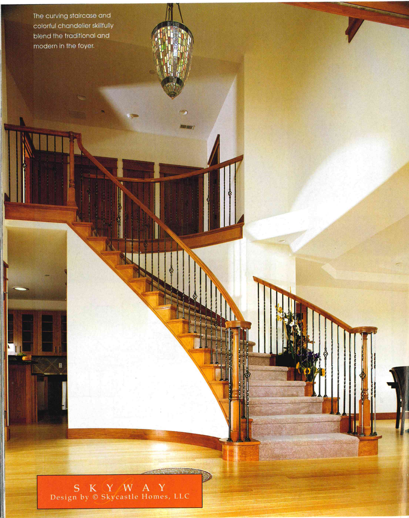
SKYWAY Design by © Skycastle Homes, LLC

The curving staircase and colorful chandelier skillfully blend the traditional and modern in the foyer.