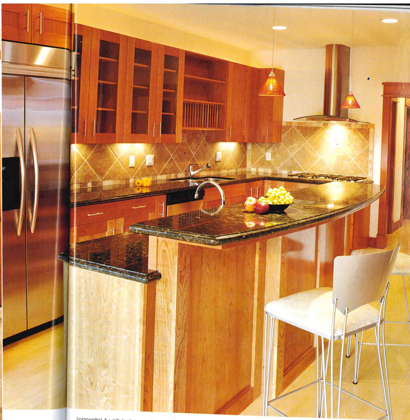
(opposite) A walk-in shower with a rainwater showerhead highlights the master suite. (above) The island kitchen includes two sinks and plenty of counter space.