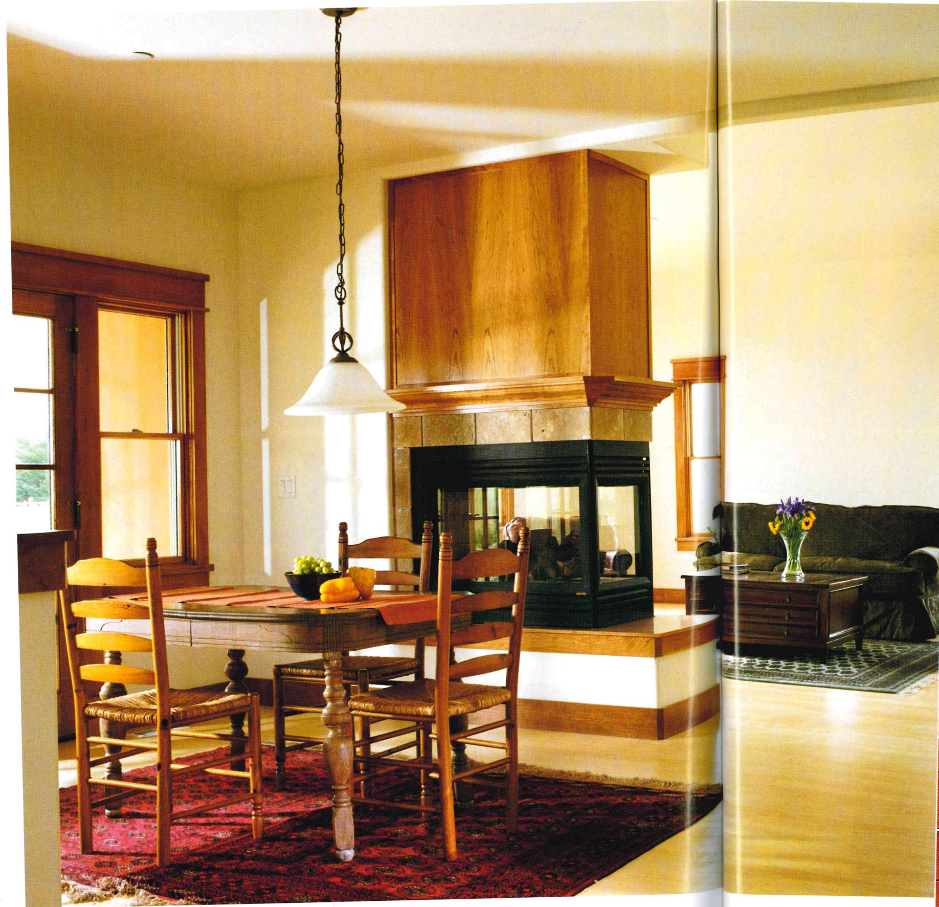
(left) The family room is partially open to the breakfast area, with only a three-way fireplace between the two spaces. (below) Dual vanities in the master bath offer the perfect mix: style and convenience.