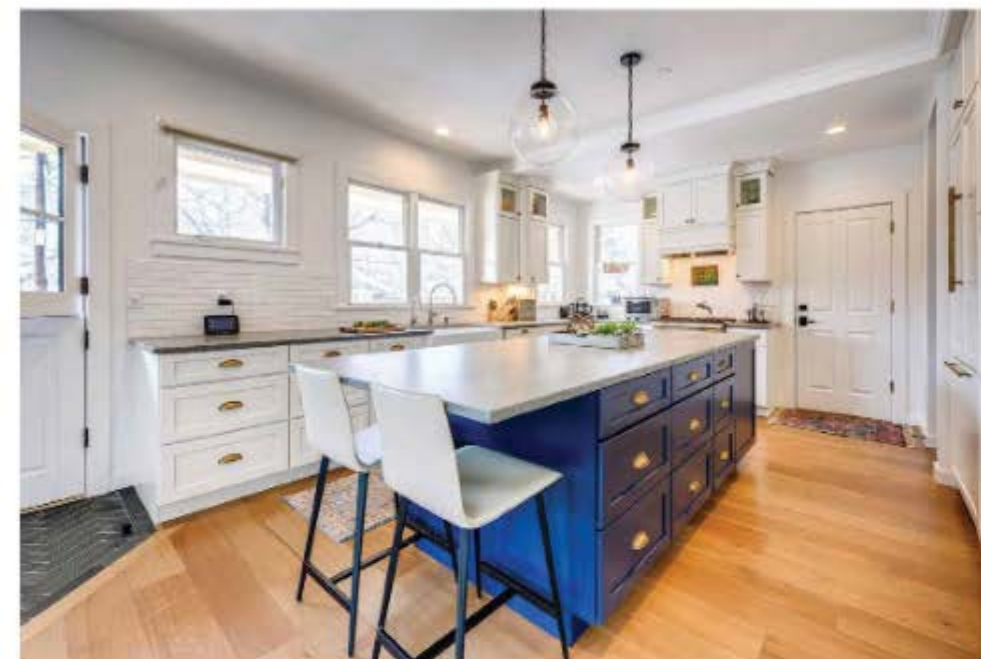
THE VISION FOR THE CONRADS' NEW KITCHEN included completely reconfiguring the existing layout, integrating the appliances into new white cabinetry and switching out the awkward curved bar for an oversize, custom-built island.