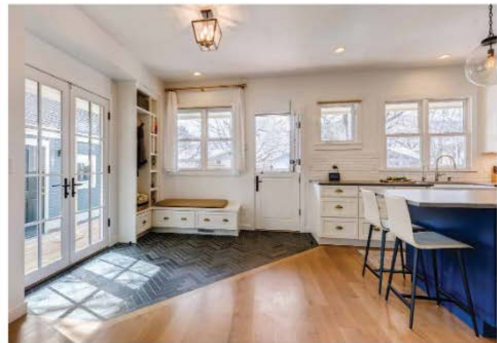
THE REMODELED OPEN-CONCEPT plan allows friends and family to seamlessly flow from indoors to out. Slate tiles arranged in a herringbone pattern define the entryway, while custom cabinets and drawers catch coats and boots.

"LOOKING BACK, WE'RE SO THANKFUL WE FOLLOWED OUR GUT AND MADE THE CHANGE."